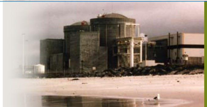
The pressurised water reactors at Koeberg nuclear station will also be used at the possible new nuclear stations.

LTMS identified wedges in three broad categories for the electricity sector – renewables, nuclear and cleaner coal. With significant public investment in R&D and demonstration going into the latter two, significantly greater effort will be needed on renewables.