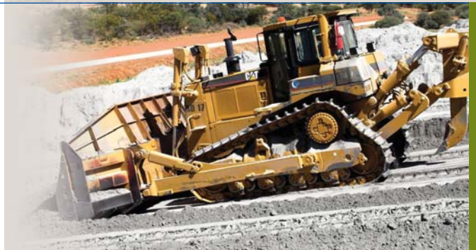
All ash dams at power stations are rehabilitated.