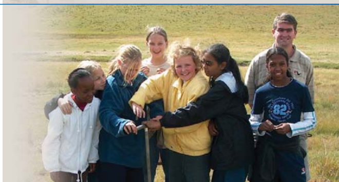
Eskom has partnered with Wessa on a very successful environmental education programme.