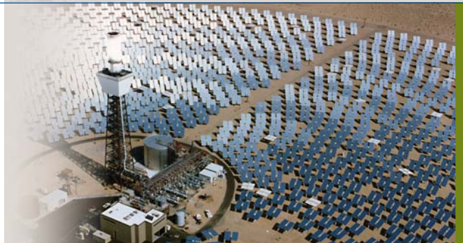
The proposed concentrating solar thermal technology to be used for the Upington area.

We accept that global initiatives to reduce CO 2 emissions will take many decades. As such the negative impacts of climate change will become a reality to which we must adapt in order to sustain our business. Adaptation risks in South Africa include an increased number and severity of droughts and floods, human settlement and thus infrastructure movements. Short-term adaptation measures include dry-cooling in our new power stations, which can reduce water consumption by approximately 90%. The trade-off is an efficiency loss and, as a result, an increase in CO 2 emissions. Medium- to long-term considerations include improving the resilience of our infrastructure and staff, by incorporating adaptation issues into long-term planning and risk mitigation strategies. Over the next year we will develop our adaptation strategy. This will be done with input from local and international experts.