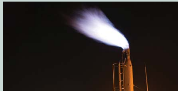
1 MW (thermal) pilot scale pulverised fuel combustion test facility and fluidised-bed combustion and gasification pilot test facility located at the Eskom Research and Innovation Centre in Johannesburg.

A number of clean coal technologies exist now and are expected to be available over the next 20 years. Examples of these are supercritical pulverised fuel, coal beneficiation, subcritical and supercritical circulating fluidised-bed combustion (FBC), fluidised-bed gasification (FBG), integrated gasification combined cycle (IGCC), and underground coal gasification (UCG). All of these technologies have advantages and disadvantages that need to be understood. Clean coal technologies are thus part of the Eskom research programme that focuses on assessing the different technologies under local conditions.