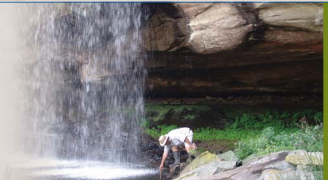
The 8 000 hectare Ingula site is managed according to strict conservation principles.

One was due to a letter of censure following the cutting of vegetation without the necessary permit. A further incident was related to a repeat of an event related to the non-compliance with conditions of authorisation for the construction of a 132kV power line. The significant increase in water-related contraventions was